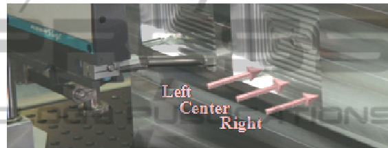
Figure 2: Surface roughness measurements.

Each of the eighteen end mill cutters cut a pocket of 100 mm x 64 mm and 15 mm in depth on the two faces of an Al 5083 plate of 500 mm x 280 mm and 60 mm in depth. The two faces were finished with a face mill cutter, 50 mm in diameter, and two recesses were constructed in order to fix the Al plate on to the machine center chuck. The cutting parameter values for each pocket are depicted in columns F, G, and H of Table 2. The surface texture parameters measured were the arithmetical mean roughness ( R_a ), maximum peak ( R_y ) and ten-point mean roughness ( R_z ).