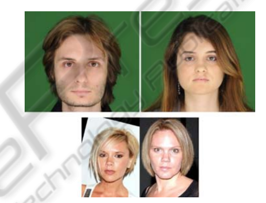
Figure 1: Pairs of siblings from the HQfaces (top row) and from the LQfaces (bottom row).

13 and 50. All subjects are Caucasian and around 57% of them are male. As an example, some cropped frontal expressionless images of siblings in HQfaces are shown in Figure 1 (top row). Currently, the DB is available on request contacting the authors. In order to verify the advantages of using high quality images, we also prepared a second database, LQfaces, containing 98 pairs of siblings found over the Internet, where most of the subjects are celebrities. The low quality photographs have an average size of 378x283, they are almost frontal, but not always expressionless, and with various lighting conditions. Profiles are not available in LQfaces. The individuals are 45.5% male, 87.9% Caucasian, 9.1% Afro-descendants and 3% Asiatic. Examples of siblings in LQfaces are shown in Figure 1 (bottom row).