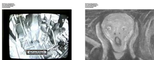
Figure 1: The example of emotional stimuli.

The audio-visual film clips that had been tested their appropriateness and effectiveness were used to provoke three different emotions (Figure 1). The appropriateness of emotional stimuli means the consistency between the emotion designed to provoke each emotion and the category (e.g., boring, painful, and surprising) of participants’ experienced emotion. The effectiveness was determined by the intensity of emotions that participants rated on a 1 to 7 point Likert-type scale (e.g., 1 being “least bring” or “painful” and 7 being “most boring” or “painful”).