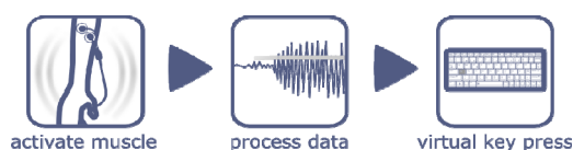
Fig. 1. Representation of the communication process.

When the muscle is activated, the amplitude of the EMG envelope increases and if it surpasses a defined threshold, the initial instant of muscular activity is accepted after validating it for sporadic activations - by checking if the end of the activation was at least 100ms after the start of the activation. If accepted, the voluntary activation is converted into a triggering event to control an external predefined software (e.g. a virtual keyboard software). This voluntary activation can be configured as a Windows keyboard event or a software specific event (implemented for ©The Grid 2, Sensory Software), and is sent through Windows Messages [15]. A block diagram representative of the overall communication flow is presented in Figure 1.