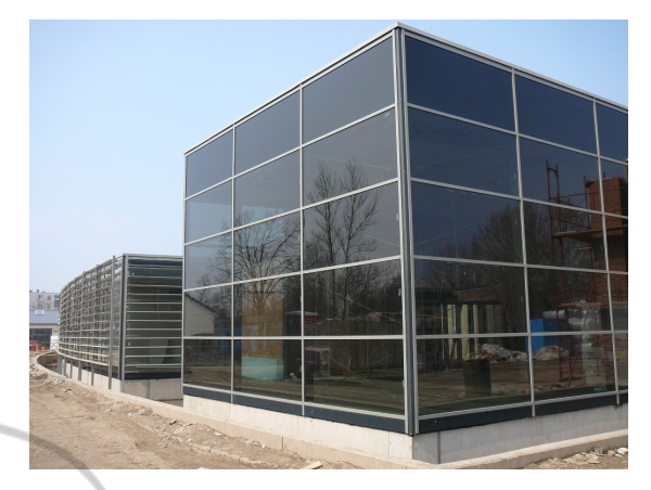
Figure 3: Intelligent Buildings (laboratories) in Dunaujvaros.

The authors wish to thank for the support from New Hungary Development Plan (TÁMOP 4.2.1.- 09/1-2009-0002) and this work is connected to the scientific program of the "Development of quality-oriented and cooperative R+D+I strategy and functional model at BME" project.