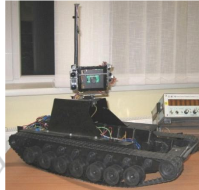
Figure 2: Mobile robot's physical model aerial view.

trip route (Baums et al., 2011). Robot's physical model mainly is used for research and student education.