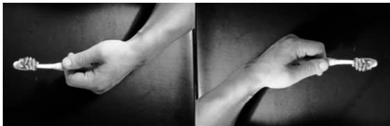
Figure 2: Illustration of the 1 st and 3 rd person perspective on the example of tooth brushing. The photo on the left illustrates 1 st person perspective (left hand), the photo on the right 3 rd person view (left hand).

perspective does not require additional mental operations, and therefore might be better suited to imitation learning. Indeed, limited evidence from clinical apraxia research suggests that patients with apraxia make less motor errors in pantomime when an experimenter is demonstrating the action when seated next to them, rather than vis-à-vis (Jason, 1983).