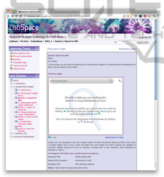
Figure 1: A learning activity featuring a ROLE widget inside an OpenLearn course.

In addition, the adoption of certain ROLE widgets inside study units of the OpenLearn platform is offering further value to informal learners by supporting a stronger framework to foster learning communities. This presents an opportunity to individual informal learners to be part of a shared learning experience instead of a lone study.