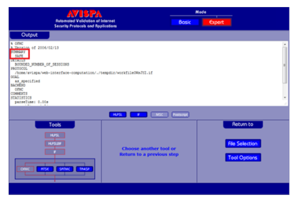
Figure 2: Message Returned by AVISPA for HIP_IKEv2 with OFMC.

Figures 2 and 3 demonstrate the messages returned by OFMC and CL-AtSe verification technique, respectively. As shown in the two figures below, the proposed solution is safe to use and no attacks were found.