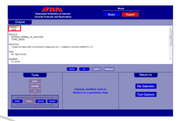
Figure 3: Message Returned by AVISPA for HIP_IKEv2 with CL-AtSe.

HIP_IKEv2 protocol makes security modification to the initial exchange of IKEv2 protocol and then integrates this modification with the HIP protocol to