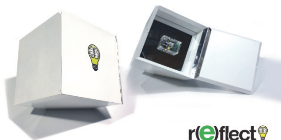
Figure 1: Parts of the teaching material r(e)flect are packaged in an interesting and excitingly designed box.

The teaching material consists of a website (see Section 3.3.) and a physical material, see Figure 1. The packaging has been given an interesting and exciting design to attract both students and teachers.