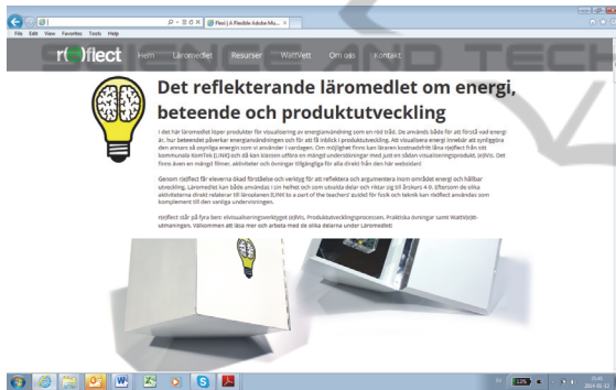
Figure 3: Front page of r(e)flect website (under development).

All material included in the box, besides the visualization tool, can be downloaded from the website. This makes r(e)flect widely available to Swedish teachers. The website also provides instructional videos for teachers and engaging informational videos for the students. Throughout the website teachers can find hints, or how to sections, for how the material can be used and linked to the traditional classroom learning. The website is under development, but some screenshots from the current website are shown in Figure 3 and Figure 4.