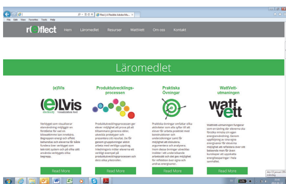
Figure 4: Website page showing the four parts of the teaching material (under development).