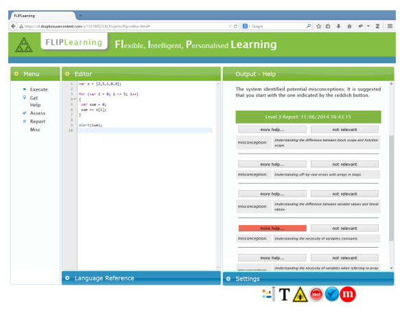
Figure 3: FLIP.

The reasoner does not make a decision on which rule to fire. It informs the user that potential misconceptions have been identified in the code and expects her to make a decision. In general the reasoner stays as discreet as possible throughout this process. The only indication that it has a preference as to which rule needs to be fired first is the colour of the corresponding button (red). This decision is based on the number of facts each rule refers to. The rule with the smallest number of facts is probably simpler to resolve and simple problems should have a priority over more difficult ones. The following figure shows