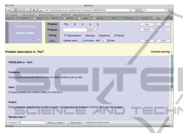
Figure 3: Mooshak System Interface.

understanding are being tested. The final goal is to provide new learning strategies to motivate students and make programming more accessible and an attractive challenge. Boss (Heng et al., 2005), Mooshak (Leal and Silva, 2008) and EduJudge (Verdú et al., 2011) are examples of such tools. Their main goal, besides testing the students' answers against a set of data input and give a rating, is to allow the evaluator motivate students through precise and rapid feedback.