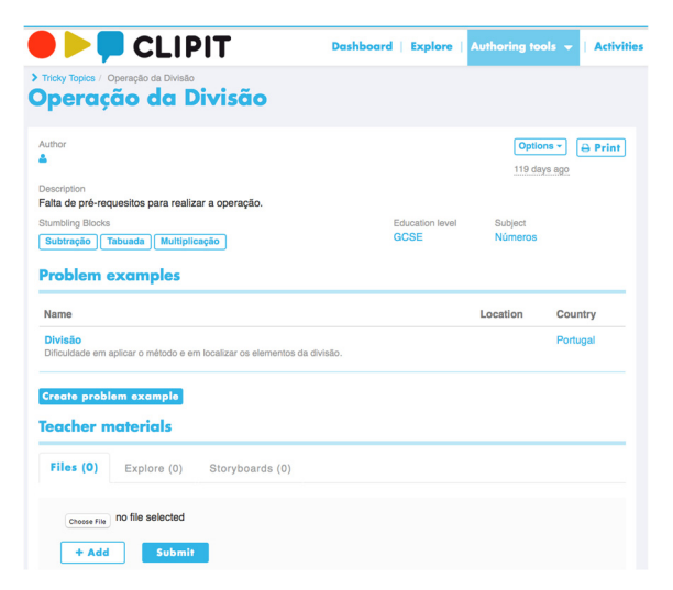
Figure 6: CLIPIT with info gathered from T2.

As they made selections from Problem Distiller tool, teachers were identifying problems that students typically encounter in understanding the concept of division and were also able to reflect on why these problems occur and how they can might be solved in the classroom.