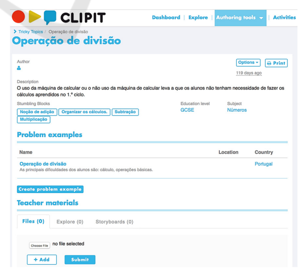
Figure 5: CLIPIT with info gathered from T1.

The Problem Distiller tool guides the teacher in identifying the difficulties of understanding of their students, adding particular examples of student problems based on the teacher's experience with students.