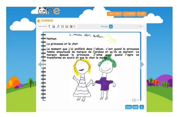
Figure 2: Example of pedagogical use of the Multimedia Notebook on VLE ONE.

focus on different actors and their specific needs and characteristics.