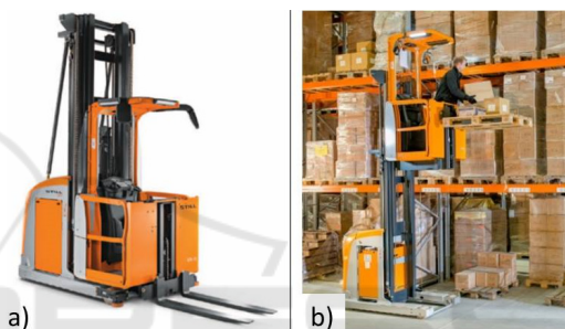
Figure 1: overview of the starting hardware platform and the current manual picking process.

Advanced navigation technologies are however not enough for accomplishing the commissioning task: when the location of the target item has been reached, identifying the exact position of the item, grasping it and placing it safely onto a pallet are all challenges that still need to be tackled. These operations involve robots abilities such as object recognition, motion, manipulation and decisional autonomy.