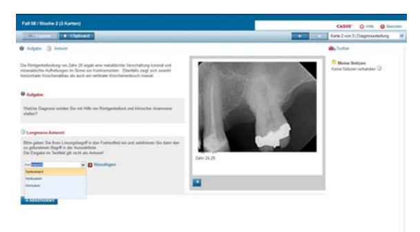
Figure 3: Screenshot Card 2 (in german) with opened long-menu.

corresponding long-menu, on card 2 all possible dental diagnoses are available. i.e. concrement, concussion or contusion. Finding of a diagnosis was not limited to a primary diagnosis, however individual diagnoses for the virtual patient were required. As a result, a diagnosis could be assigned to every X-ray examination.