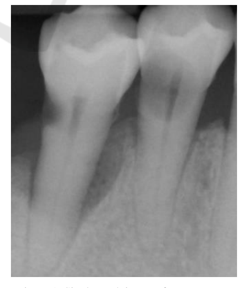
Figure 1: Single tooth images from an x-ray.

technique, the dentist can link and interpret the clinical picture with the radiological image. Before manufacturing new dentures, problems can be detected and corrected if necessary.