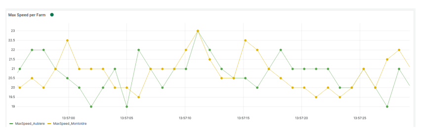
Figure 3: Visualizing the results of Que.1 with Grafana.

4 COMPONENTE 2, INVESTIMENTO 1.4 - D.D. 1032 17/06/2022, CN00000022). This manuscript reflects only the authors' views and opinions, neither the European Union nor the European Commission can be considered responsible for them.