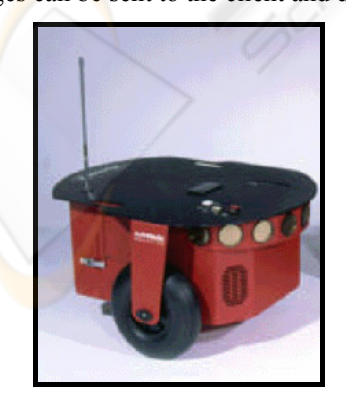
Figure 1: The holonomic robot Pioneer 2DX

is a client-server architecture, which can support many robots. The robots are identified by an independent name. JMR can run different processes in any robot, and connect to the Saphira simulator to communicate to a real robot. The client controls devices such as sonars and cameras; it also controls speed and reads the distance from the robot to any obstacle; it is also possible to know the robot status, and we can dictate the distance to travel and the degrees to rotate. The server receives and simulates the commands sent by the client. In the server we can load the worlds where the robot will navigate, and read the images captured by the robot cameras, such images can be sent to the client and displayed.