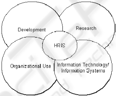
Fig. 1. The Initial Framework of HRIS with the basic categories; IT/IS, Organizational Use, Development and Research.

Our initial framework of HRIS bases itself on the literature review. We also study internet sites of HRIS business and practices which have given us an empirical background to explore our knowledge. When we examine the literature and articles, we perceive that the issues these articles were mainly discussing can be divided into four basic categories. The basic categories of our initial framework are presented in Figure 1.