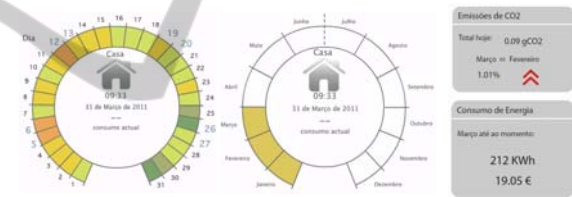
Figure 1: Eco-feedback user interface snapshots, from left to right: month view, year view, real time view (CO 2 /Month, kW/h and Euros/Month).

The interface also presents real time data to the user, namely power consumption in watts and power events. Figure 1 shows a snapshot of the eco-feedback user interface.