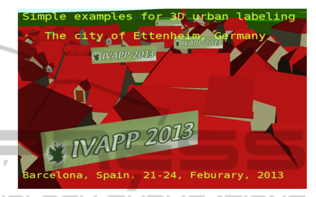
Figure 3: HUD annotation and annotation with a text container are also placed.

Besides three texts described above, HUD annotation and annotation with a text-container are also placed as showed in Figure 3: