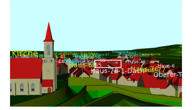
Figure 2b: As viewpoint changes, fading text adjust themselves while the other two texts do not.

As viewpoint changes, 'Haus-72' disappears as it is occluded by'Haus-78-1-Dach', as showed in Figure 2b. While there are too many occlusions among the other two types of texts which make annotations unreadable. Fading texts remain clear.