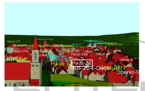
Figure 2a: Viewpoint A for comparing performances of different types of annotation.

Let's take'Haus-72' in the white rectangle as example to compare performances among these three types of annotations. Currently at this viewpoint, occlusions of linking texts and floating texts occur but not so much, and there's no occlusion among fading texts, as showed below: