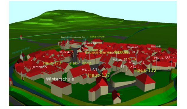
Figure 2c: Another viewpoint for the scene.

In Figure 2c above is another viewpoint of the scene after a rotation around the scene. Floating text and fading text still remain readable while linking text is hard to recognize. In order to better simulate the real 3D world, annotations can be set as linking text but readability can hardly be maintained.