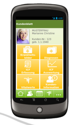
Figure 2: Patient sheet.

Task 3: Documenting the health status with ICF. This task deals with the core of our application, the recording of health-relevant data based on ICF codes. The participants were asked to evaluate the code "d450 Gehen". For this purpose we provided further information (diagnostic findings of nursing staff etc.).