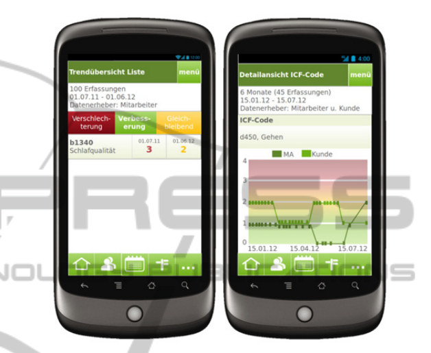
Figure 5: ICF trend view (left) and details view on the ICF-code "d450 Gehen" (right).

Task 4.1: Figure 5 (left) shows the alternation of certain ICF codes over a certain period of time. In this figure the current ICF assessment is compared to 100 acquisitions. Our test persons have not been able to correctly interpret this alternation. The following issues have been discovered due to this test.