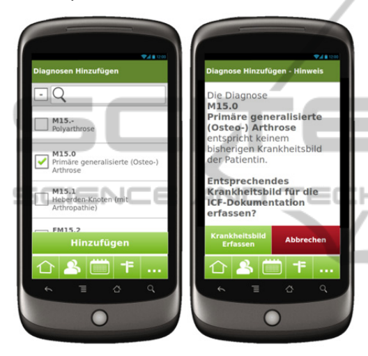
Figure 3: Acquisition of ICD diagnosis (left) ICF classification (right).

Recommendation: Choose a unique and wellknown term that captures the functionality of the app also for users with a low knowledge of ICF so that these users are able to associate the right functionality with the term.