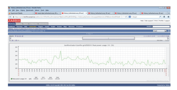
Figure 2: Monitored eco-metric (courtesy of INRIA).

Due to the application of VM consolidation techniques, based on the target goals of DCMM (GreenGrid, 2011), we can assume that the load of the servers can raise from 20% to 60%, owing to activating and deactivating the VMs as needs arise.