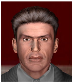
Figure 1: John model exhibiting two different facial expressions.

Next, we proceeded to the animation of these characters considering the characteristics and functionalities of the software tools involved in the implementation of the application: Blender (url-Blender) and a free version of Unity3D (url-Unity). In Unity, animations are obtained through rigging animation, i.e., by animating a skeleton, a hierarchical structure of interconnected bones.