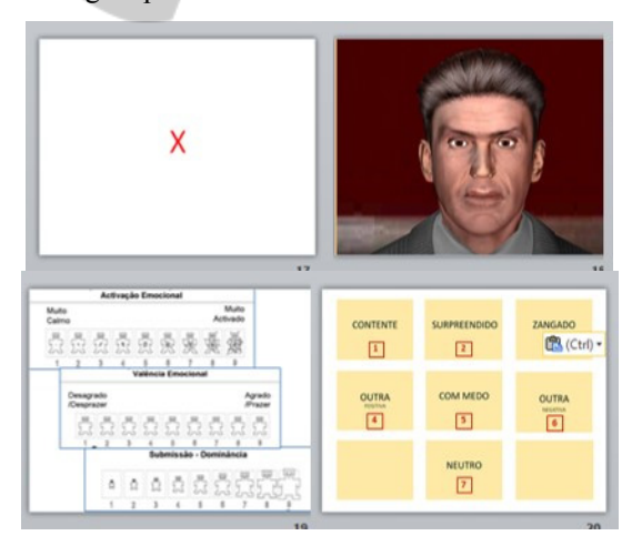
Figure 6: Types of screens in the user experience.

In regard to content, an independence X^2 test performed on the cross tabulation of composition and content, showed a highly significant association between images and label ( X^2 =2088.07; p<=.001; N=978), with 12 out of 28 clips presenting convergence above 75% (6 on the label angry, 4 on happy, 1 on surprised and 1 o neutral). Convergence was congruent with the expected content in all convergent pictures.