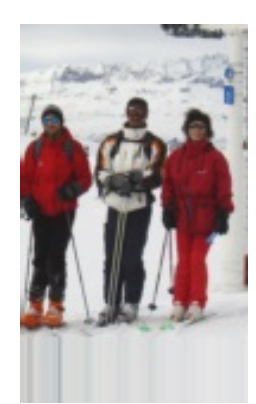
(a) Positive Example.