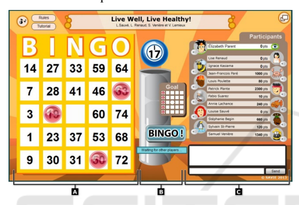
Figure 1: Live Well, Live Healthy!

According to a survey of 932 Canadian seniors (Kaufman et al., 2014), the Bingo game was found to be the most frequently one mentioned by respondents. Figure 1 represents the Live Well, Live Healthy! game interface which is divided into three parts: a) the Bingo card, rules and tutorial; b) information on the game's progress: the type of game, randomly drawn ball, and the Bingo button for ending the game; and c) information related to the players' actions: players' names and scores, as well as the microphone and chat control buttons.