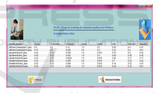
Figure 3: A screenshot of the Metrics Calculator MUI of PLAIN.

This second module aims to calculate the quality metrics values according to our aforementioned formulas (see section 2). It has as input the values of components properties and generates as output the measures of quality metrics. The evaluation metrics are: density, regularity, composition, sorting, complexity, symmetry, and repartition. Figure 3 shows the values of these evaluation metrics.