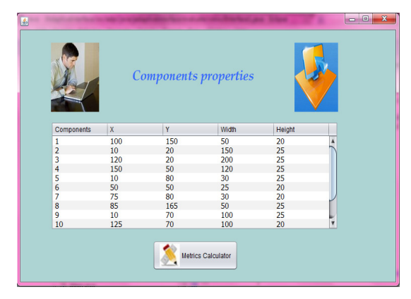
Figure 2: MUI properties values using PLAIN.

First, our plugin parses the source code of MUI to extract components' properties values. These values would be used to calculate the measurement of quality metrics. Our plugin needs to extract width, height, alignment, axis of coordinates for the left top point of an object, etc. This module will be started when the evaluator clicks on Identify Problem button, the MUI properties extractor parses the source code of MUIs and extracts the MUI component properties. Figure 2 presents the values of these properties.