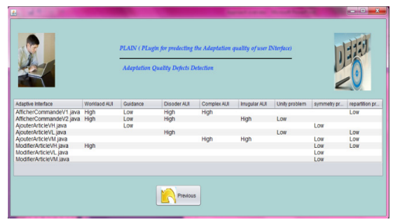
Figure 5: A screenshot of the defects detection of MUI using PLAIN.

Once threshold values are adapted to the current mobile applications, the problems can be detected. As figure 5 shows, PLAIN lists the detected problems of each MUI.