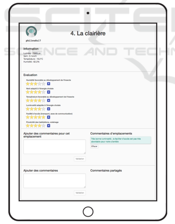
Figure 3: Pickit on one student's tablet, from the top to bottom showing the location title, location information, rating, comment for the location, and comment in general.

step-lists with the current step highlighted, to help students understand their progress and the ongoing task.