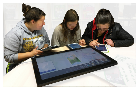
Figure 1: Three students using Pickit.

Pickit, the application developed, uses the combination of a tabletop and tablets to support analytical decision-making process (Figure 1). The tabletop is mostly dedicated to viewing the decision-making context and the tablets are dedicated for browsing the data about each location, i.e. the options in the decisionmaking model.