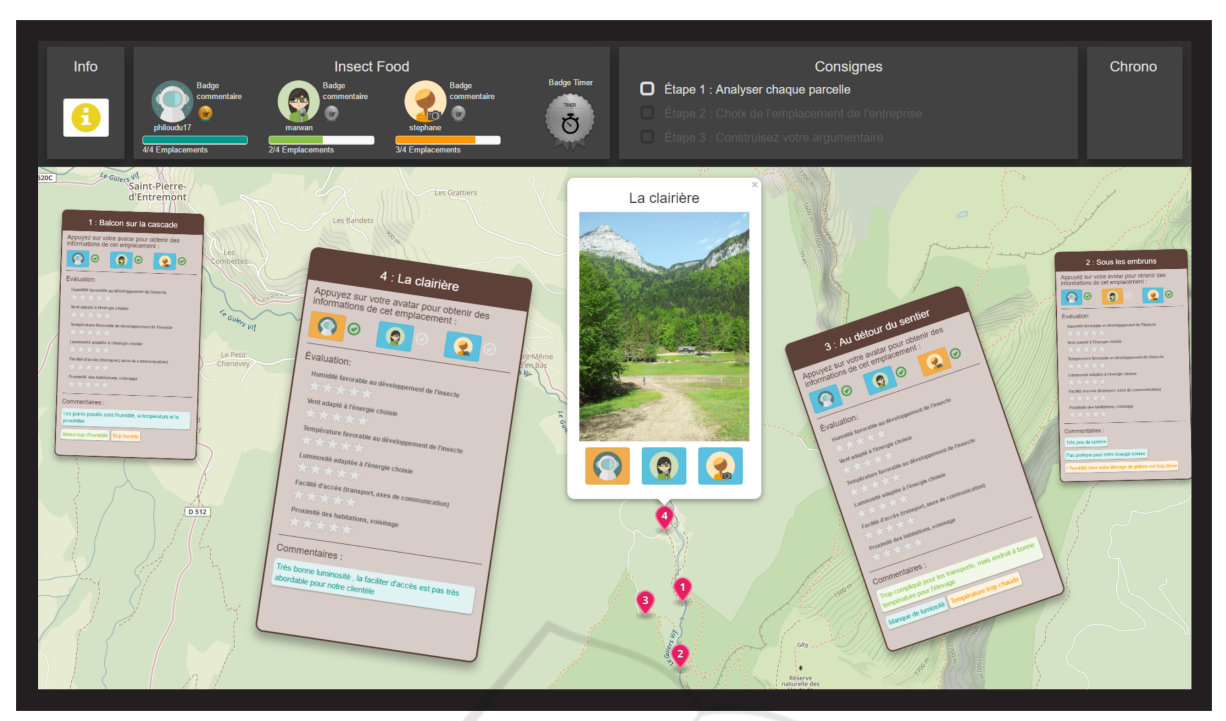
Figure 2: Pickit on tabletop. A screenshot of the survey stage.