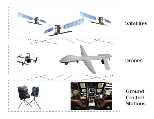
Figure 2: Drone technology - technical view.

Even though the technology-specific view on drone functioning is to be consistent with the conceptual view, there are more technical and operational details that are to be considered in such a technology perspective. A partial technology-specific view on drone functioning is depicted in Figure 2: