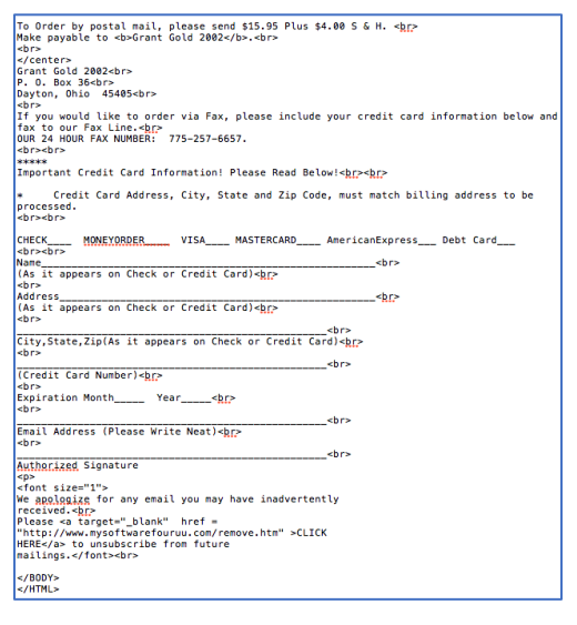
Figure 4: A spam mail example.

We used with most standard textual features (e.g., TF-IDF, TF, Binary) to restrict the scale of our study and emphasize the expected gain from utilizing some unexplored properties of the dataset, as well as the limit of the majority-voting like mechanism.