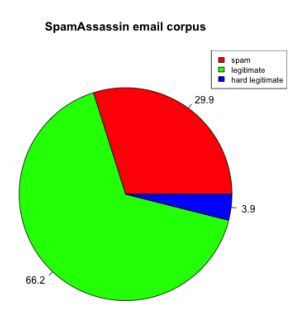
Figure 1: Statistics of the corpus used in the experiment.

The corpus consists of a total of 6100 legitimate (ham) and unsolicited (spam) emails. The legitimate emails are sub-categorised into hard legitimate emails (spam resembling structure; subscribed promotions) and generic emails. Spam ratio is 30%, and there are 250 hard legitimate emails as highlighted in Figure 1. An example of instance of emails is depicted in figures 2-4.