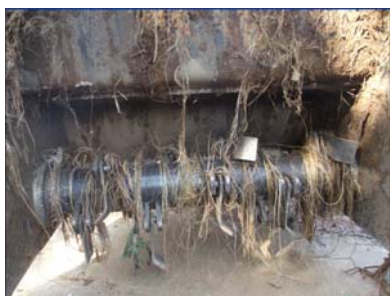
Figure 2: Returning L shaped flail crushing structure.

Pineapple leaf shattering and returning machinery in general operation mainly due to low efficiency, high operation energy consumption is due to its unique biological characteristics and mechanical properties of the pineapple stem leaf shattering and returning machine into the pineapple, tend to be the 2-3 smash, in order to make the crushing effect and meet the requirements of the proportion (pineapple stem and leaf length is less than 15cm is not less than 90%), but in second times, third times in the process of grinding, pineapple stem leaf and ground surface close to earth mixed together, to crush it, must reduce the crushing knife stick of pineapple leaf and soil mixture crushing operations, so that the energy consumption increases, at the same time. 2-3 means crushing tractor repeated rolling land, resulting in land compaction, is not conducive to subsequent tillage operations (Ou Zhongqing, 2017; Zhang Yurong, 2017). Therefore, the most direct way to reduce the problem of low efficiency, high energy consumption and soil compaction of pineapple stem and leaf is to reduce the operation times of pineapple stem and leaf crushing and returning machine under the premise of ensuring the grinding rate.