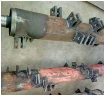
5a Machining chart of knife stick + cutter seat