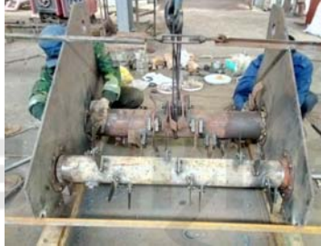
5c Installation diagram