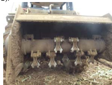
Figure 1: The structure of returning hoe shaped grinding knife.

transported to the fields through artificial or bulldozers and other equipment, dry incineration or compost into fertilizer, caused by a certain degree of pollution to the environment, in order to solve this problem, at the end of 80s, China began the study of crushed pineapple leaf returning machinery and technology, and experienced a multi-stage harrow flail chopped, stems and leaves of pineapple cut and crushing stage, the existing models mainly include: hoe shaped flail of pineapple leaf shattering and returning machine (Figure 1) and improved L shaped flail pineapple leaf shattering and returning machine (Figure 2).