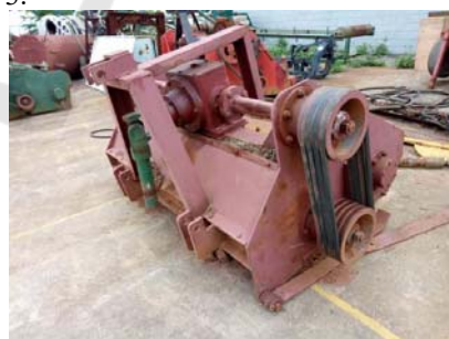
Figure 3: Structure diagram of a double knife roll pineapple pulverizing machine.

Double knife roller pineapple stem and leaf shattering and returning machine, which comprises a frame, a supporting rod, a transmission mechanism, the knife roller assembly, the knife, the knife roll assembly, fixed knife, wheel, which is characterized in that a frame is arranged at the tail part of the front plate, a support rod arranged inside the rack and the gear box, the middle part. With a knife before and after the knife roller assembly and assembly; the knife roller assembly and the knife roller assembly is assembled above the fixed knife before and after the fixed knife, the knife roller assembly via a front seat with the knife edged knife mouth and pin hinge, the front end is provided with a a belt wheel, and is fixed on the power output shaft of the gear box at one end of the driving pulley is connected through the V belt, the other end is provided with a front pulley and fixed on the rear end of the knife roller assembly after the belt wheel is connected through the V belt, after the knife roller assembly through after the knife holder and is fixed to the bolt group straight knife (Xie Yanmin, 2017; Cui Zhende, 2013). The whole machine structure is shown in Figure 3.