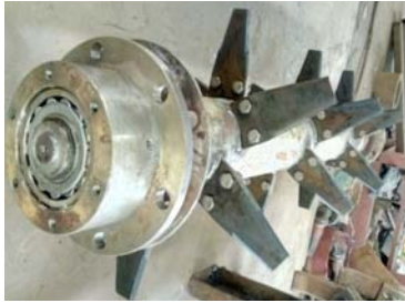
5b Tool bar + knife seat + blade machining map