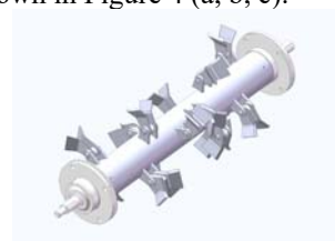
4a Model diagram of front roller

Roll design before considering the cutters and stick the assembly simulation test calibration, modal analysis shows that the knife roller of the first 5 natural frequencies in the range of 0.0018 ~ 0.0163Hz can effectively avoid the inherent frequency of the knife roller, so far, to ensure that the high-speed operation of the knife roller is reliable, then processing and installation. Simulation results are shown in Figure 4 (a, b, c).