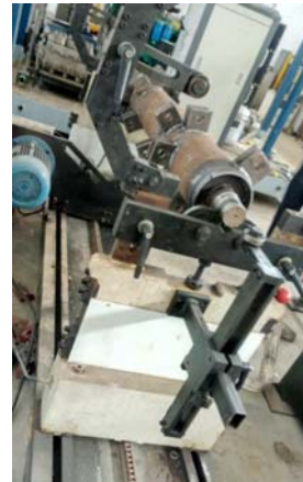
6a Machine effect

Double roll pineapple stem leaf shattering and returning machine balancing using HSC type China Guangdong Foshan Shunde electric machinery industry limited company to test the dynamic balancing machine, the 75g standard balance principle, the detection process marked with standard magnet after welding of metal materials by way of balance. The detection process is shown in Figure 6 (a, b).