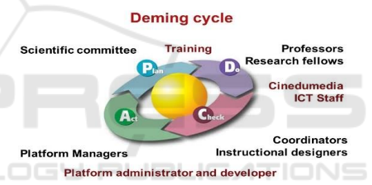
Figure 1: The Deming Cycle.

In order to prepare the online courses, people involved in start@unito used their best knowledge about didactics and technology. In fact, it is universally acknowledged that technology itself is not enough for extracting the best from the learning process. The actors involved in the project adopted a model for the preparation of the open online courses inspired by the Deming Cycle: Plan, Do, Check, Act.