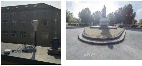
Figure 1: The two test sites: the place that represent the noisy environment (left, site A) and an undisturbed place (right, site C).

The second one is an undisturbed site, characterized by the absence of reflective surfaces, electromagnetic disturbances and with optimal conditions for tracking satellites (e.g. no obstructions). These two sites, namely A and C (Figure 1), respectively, represent the two main conditions where a user works or tries to perform positioning activities.