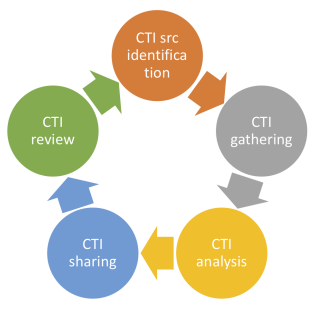
Figure 1: The CTI life-cycle.

Threat Intelligence Reports. These include documents that describe TTPs, types of systems, adversaries and target information, as well as any other